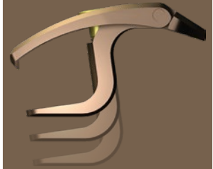
Multiple plate options