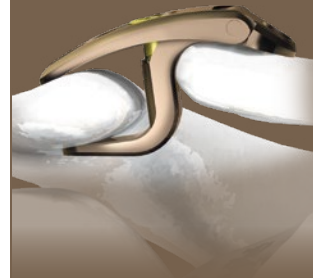
Design aligned with anatomy