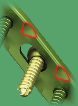
Bottom undercuts of the shaft part